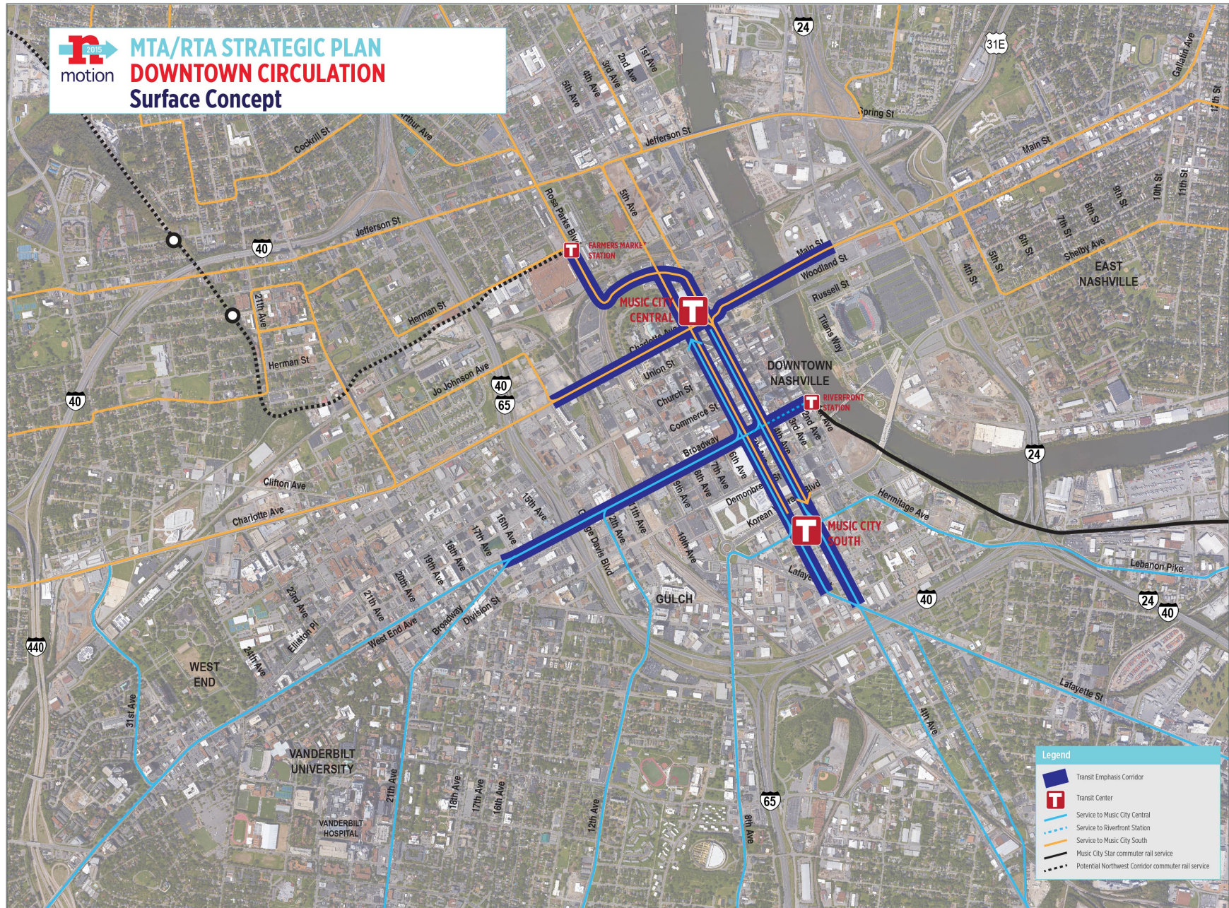
FIGURE 5 | SCENARIO 1 DOWNTOWN CIRCULATION CONCEPT