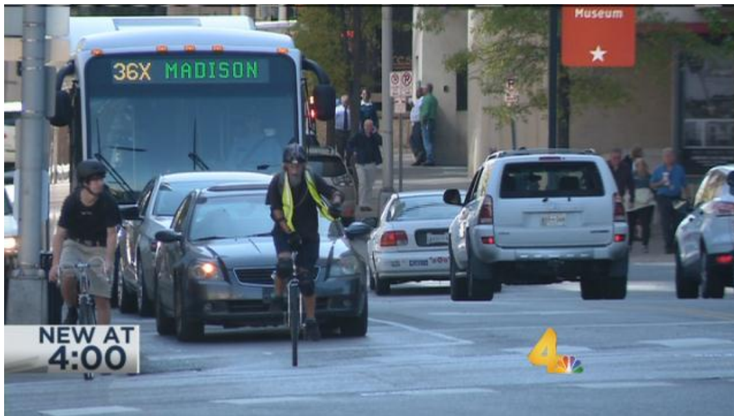
FIGURE 1 | EXPRESS BUS IN TRAFFIC IN DOWNTOWN NASHVILLE