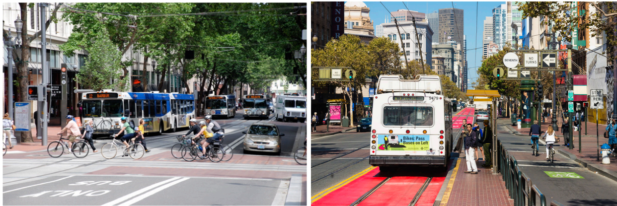
FIGURE 2 | TRANSIT EMPHASIS CORRIDORS (PORTLAND, OR AND SAN FRANCISCO)

Major benefits of transit emphasis corridors are that they make transit service faster and more reliable. Transit emphasis corridors also typically include more significant and higher quality stop facilities, which helps to make transit service more comfortable.