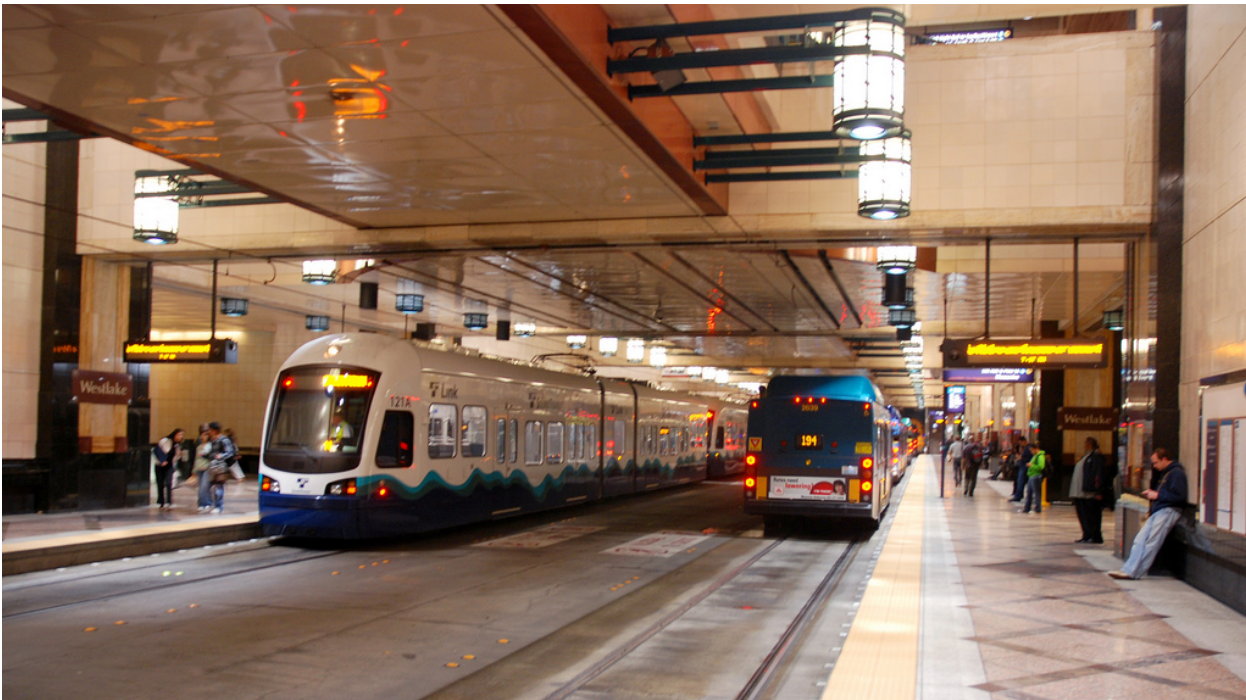
FIGURE 6 | SEATTLE TRANSIT TUNNEL WITH LIGHT RAIL AND BUS OPERATIONS

Finally, it should be noted that design specifics of individual services would be developed during project development. In many cities, light rail operates on the surface in outer areas and in subways in downtown areas (for example, Boston, Seattle, Pittsburgh and San Francisco, among others). With Scenario 1, Nashville light rail could be developed in a similar manner. In that event, some bus service – for example, BRT and Rapid Bus –could also operate in the same tunnel or tunnels, as in the case in Seattle (see Figure 6). This approach would place the most significant transit infrastructure underground, and eliminate all heart of downtown-related traffic delays. Scenario 2 could also use a similar approach for major bus services. While not included in any of the scenarios, or cost estimates, a very preliminary examination of this option indicates that tunnels could be constructed under downtown Nashville at a cost of $100 to $300 million per mile (as a frame of reference, the distance between Charlotte Avenue and Broadway is about 0.4 miles). The development of stations would be additional.